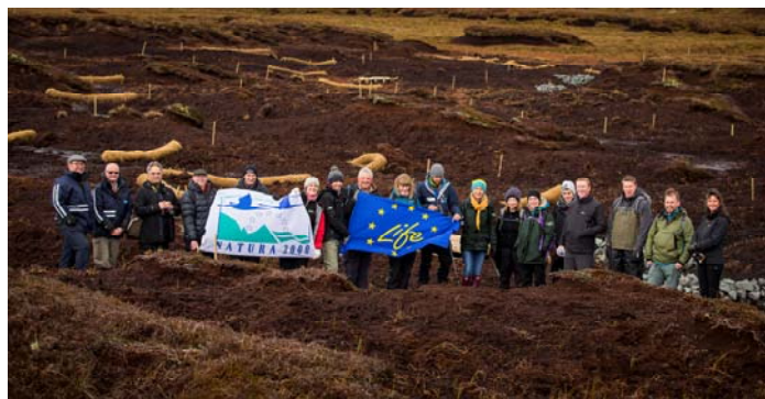
Photo: Celebrating North Pennines peatland restoration projects with the UK Environment Agency, October 2018.