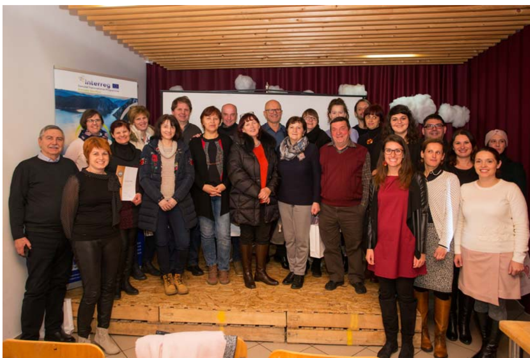
Local providers, awarded the Idrija UGG trademark “Idrija izbrano – selected” Certificate

Representative photo with caption (from the most important event this year)