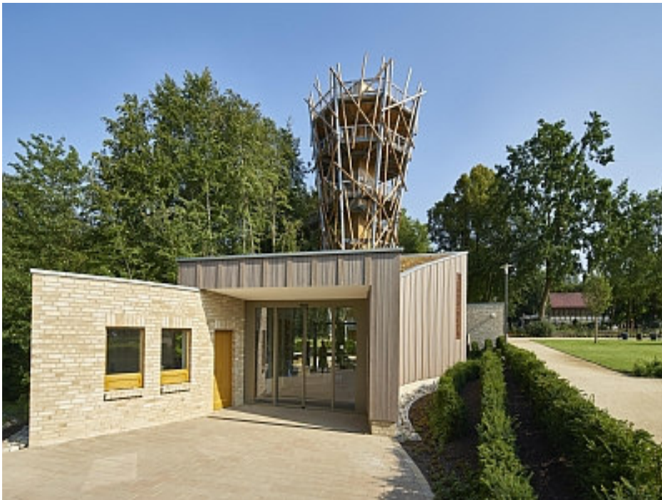
New TERRA.vita pavilion in Bad Iburg, serving as permanent entrance gate for the new canopy trail in the future

Year of inscription: 2001 / Year of the last revalidation: 2015