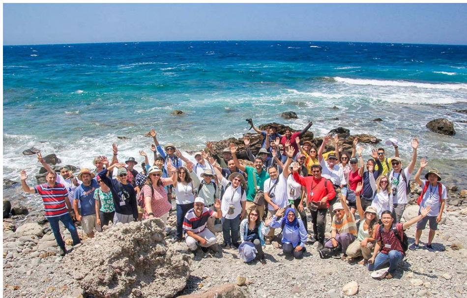
International Intensive Course on Geoparks 2018 Visiting of the Nissiopi Marine Petrified Forest Park

Year of inscription / Year of the last revalidation: 2000 & 2012 /2016