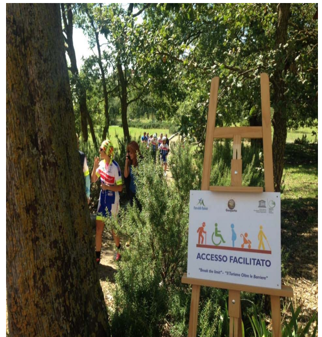
4- easy access