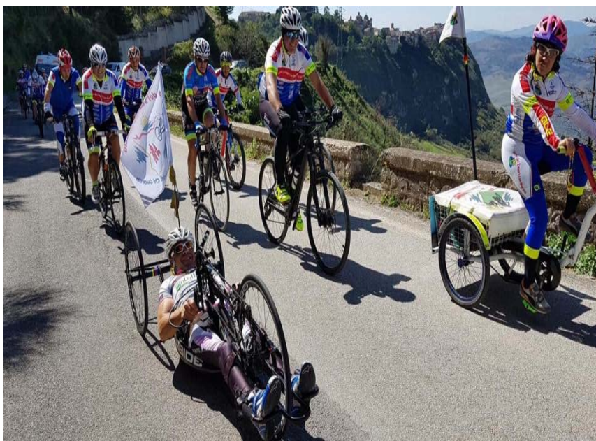
3- bicycle tour - hand bike