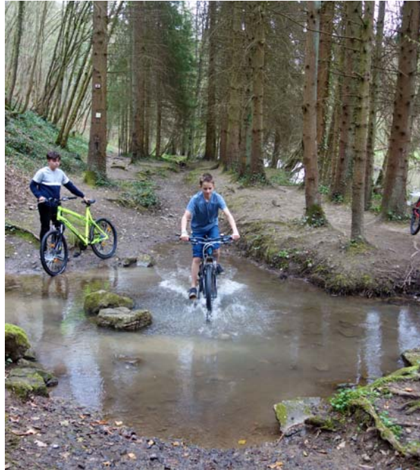
Young testers in action on our Geowalking Tellin

Year of inscription / Year of the last revalidation: 17 th April 2018