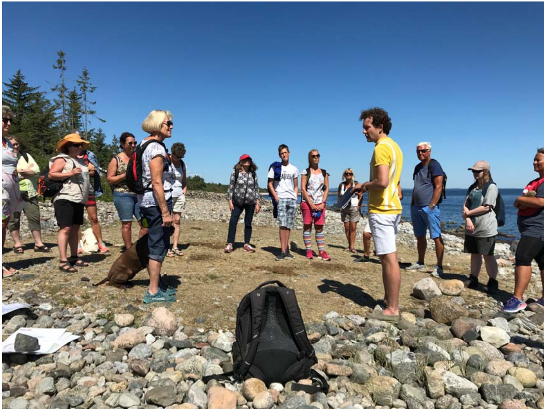
Photo: "The painter Theodor Kittelsen and the secret of the moraine island"

Gea Norvegica UNESCO Global Geopark, Norway, EGN 2006 / 2017