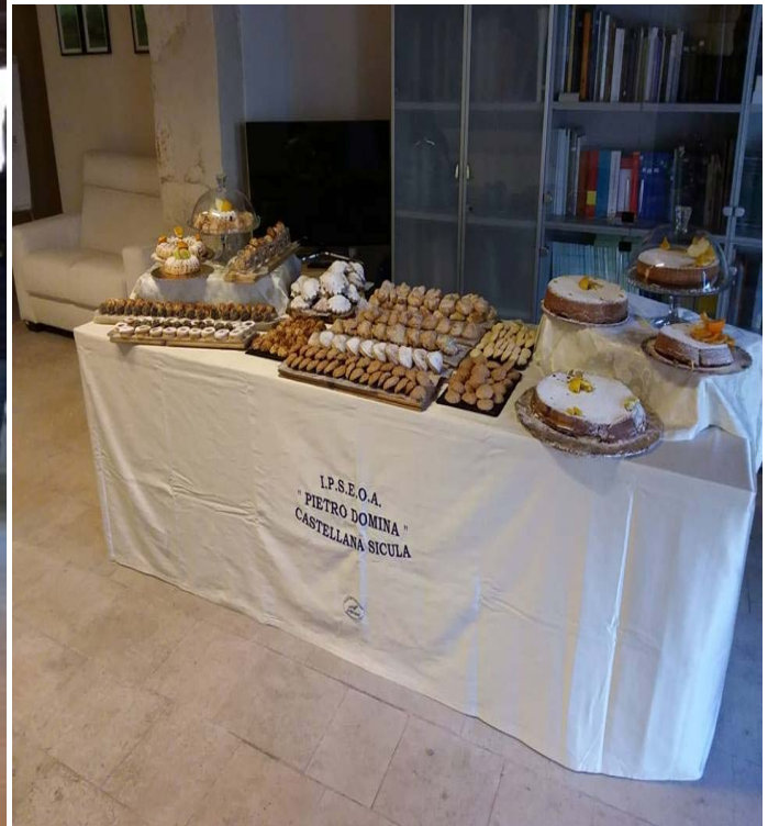
2- project alternation school work