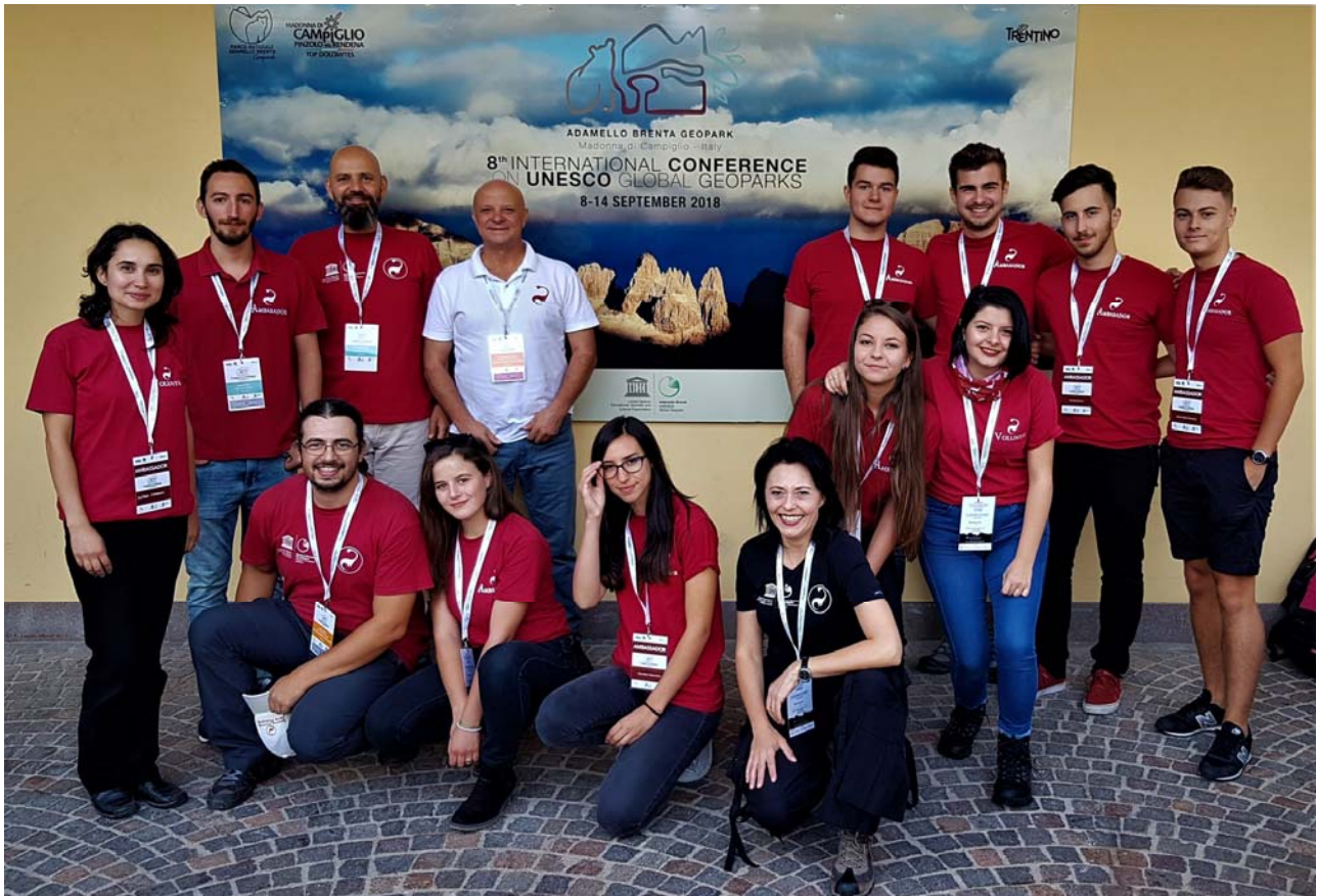
Geopark Staff and youth ambassadors at the GGN meeting in Adamello Brenta

Year of inscription / Year of the last revalidation: 2005 / 2018