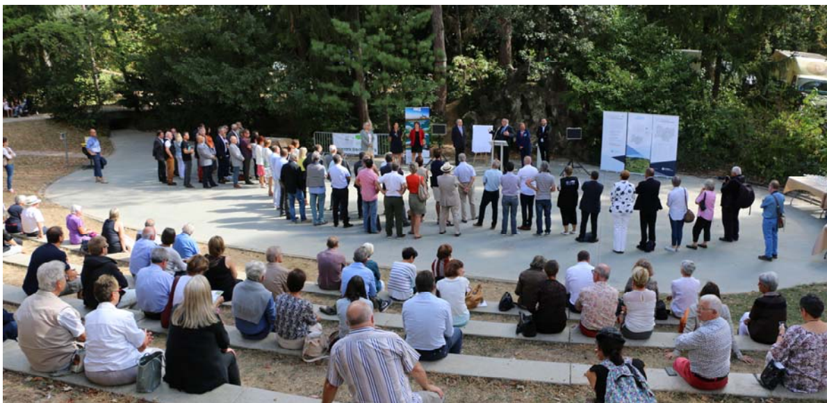
Official speeches during the celebration of the UNESCO Global Geopark label, September 2018

Year of inscription / Year of the last revalidation: 2018 / -