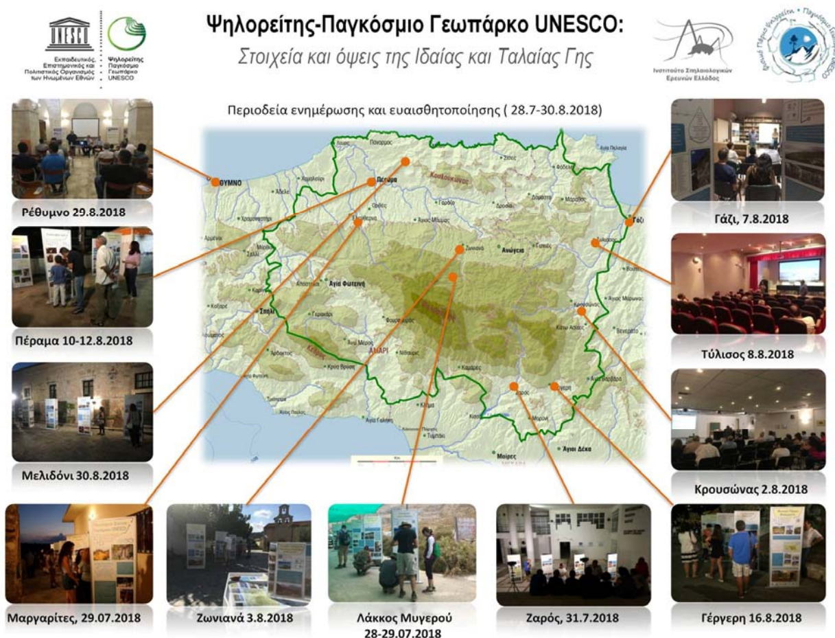
Figure 1 The various places where events were organised during EGN week 2018

Representative photo with caption (from the most important event this year)