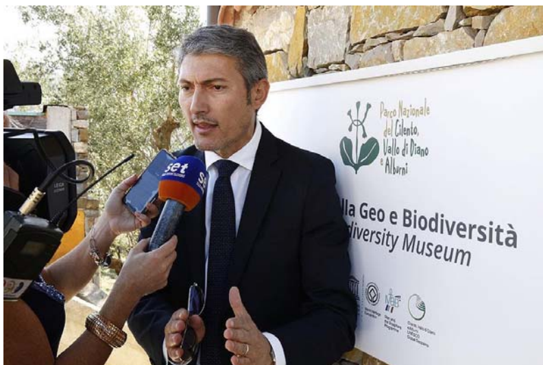
Inauguration of the Geo biodiversity Museum

Year of inscription / Year of the last revalidation: 2010 / 2018