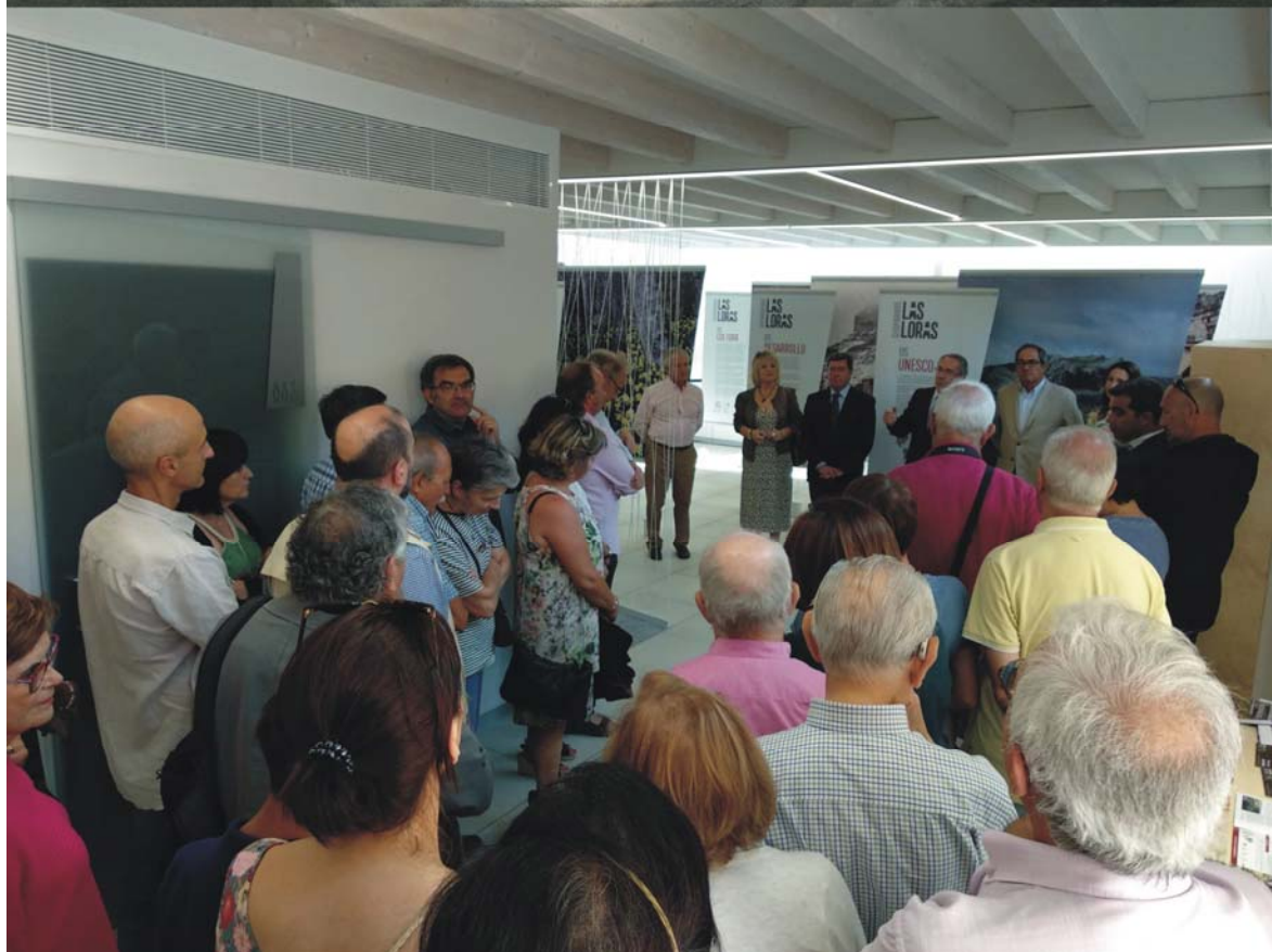
Inauguration of the visitor centre