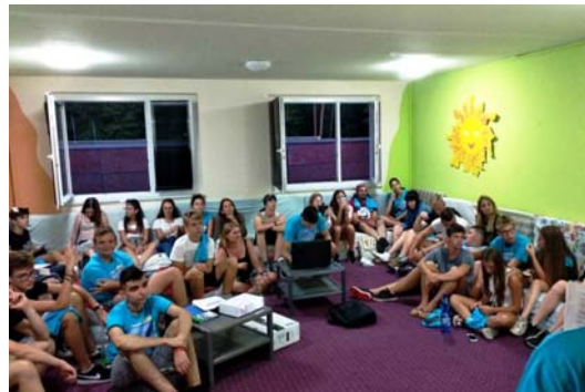
daily “come together” of the youth camp participants for cultural exchanging