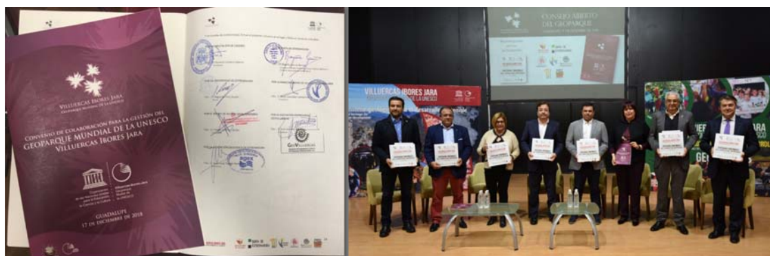
New agreement for the management of Villuercas-Ibores-Jara UGGp. 17th December, 2018.

Representative Photo (from the most important event this year)