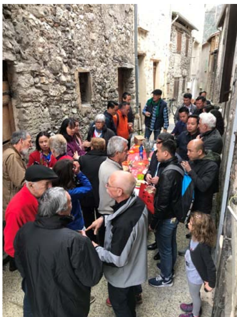
The CaoBang UGGp delegation meeting population in La Javie village.