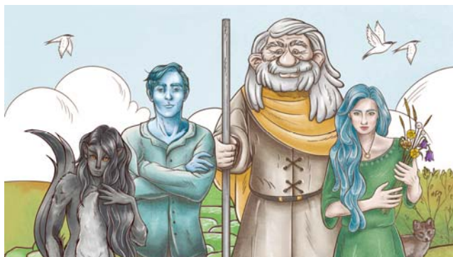
The World of the Guardian Spirits on the Reykjanes Peninsula

Year of inscription / Year of the last revalidation: 2015