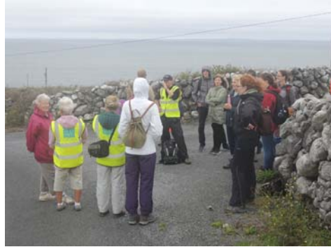
National Heritage Week guided walk August 2018

Year of inscription 2011. Year of the last revalidation 2015