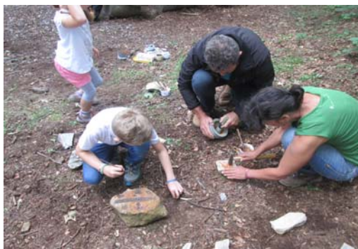
Painting with natural colours / summer academy

Year of inscription / Year of the last revalidation: 2014 / 2018