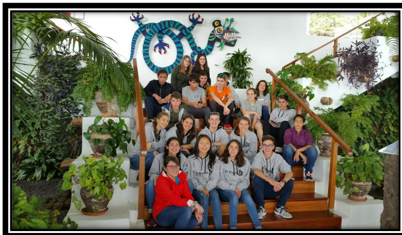
First edition “Young Ambassadors Geoparks 2018”. Comarca Molina- Alto Tajo- El Hierro Geoparks

Representative photo with caption (from the most important event this year)