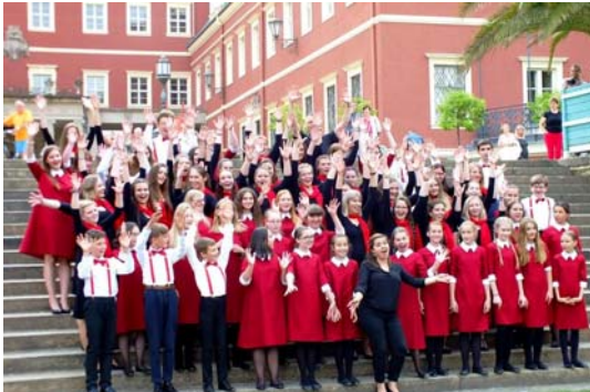
singing german and polish youth choirs in the Neiße breakthrough valley

UNESCO Global Geopark Muskauer Faltenbogen / Łuk Mużakowa (Germany / Poland), European Geopark Network 2011 / 2015