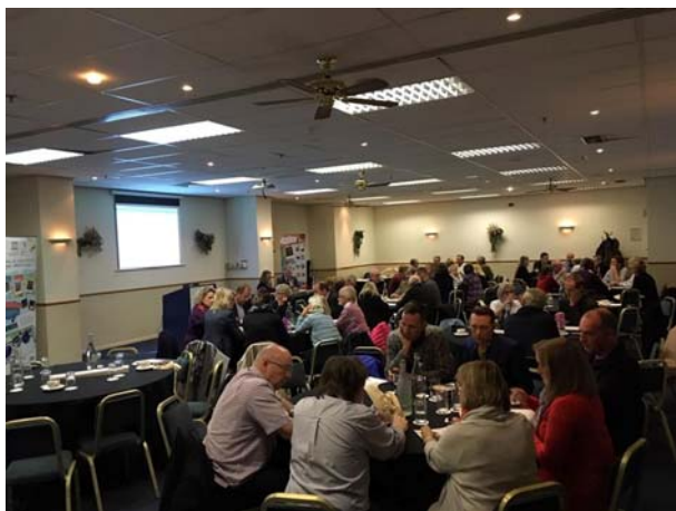
The Rocks Connect Us ERUGGp Briefing Day Nov 2018

Year of inscription - 2007 / Year of the last revalidation – 2015