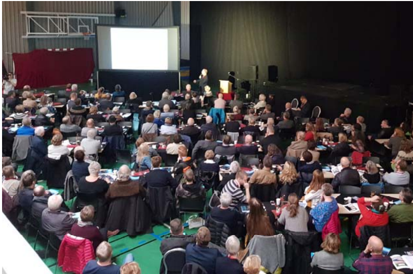
Katla Conference in Vík regarding 100 years from the last eruption in Katla Volcano, 12 th of October 1918