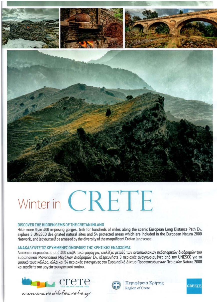
Image form the airplane magazine of the largest airlines in Greece (Blue magazine, Aegean airlines Winter 2019)