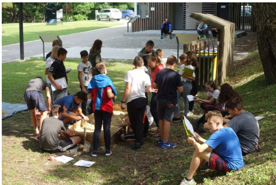
Three days School-In-Nature camp

Year of inscription 2007 / Year of the last revalidation 2017