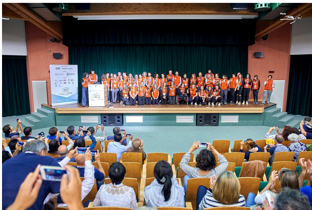
Photo: Geopark Ambassadors and staff of Adamello Brenta UGG and Tourism Board of Madonna di Campiglio-Pinzolo-Val Rendena at the Closing Ceremony of the 8 th International Conference on UNESCO Global Geopark, 14 th September 2018.

Adamello Brenta UNESCO Global Geopark, Trentino, Italy (European and Global Geoparks Network). Year of inscription 2008 / Year of the last revalidation 2018.