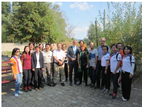
Delegation visit of Geopark Managers from China and Japan

Year of inscription / Year of the last revalidation: 2002 / 2016