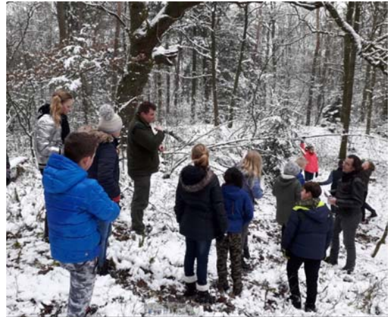
Getting advice from a school class about the Hunzebos 3D project.