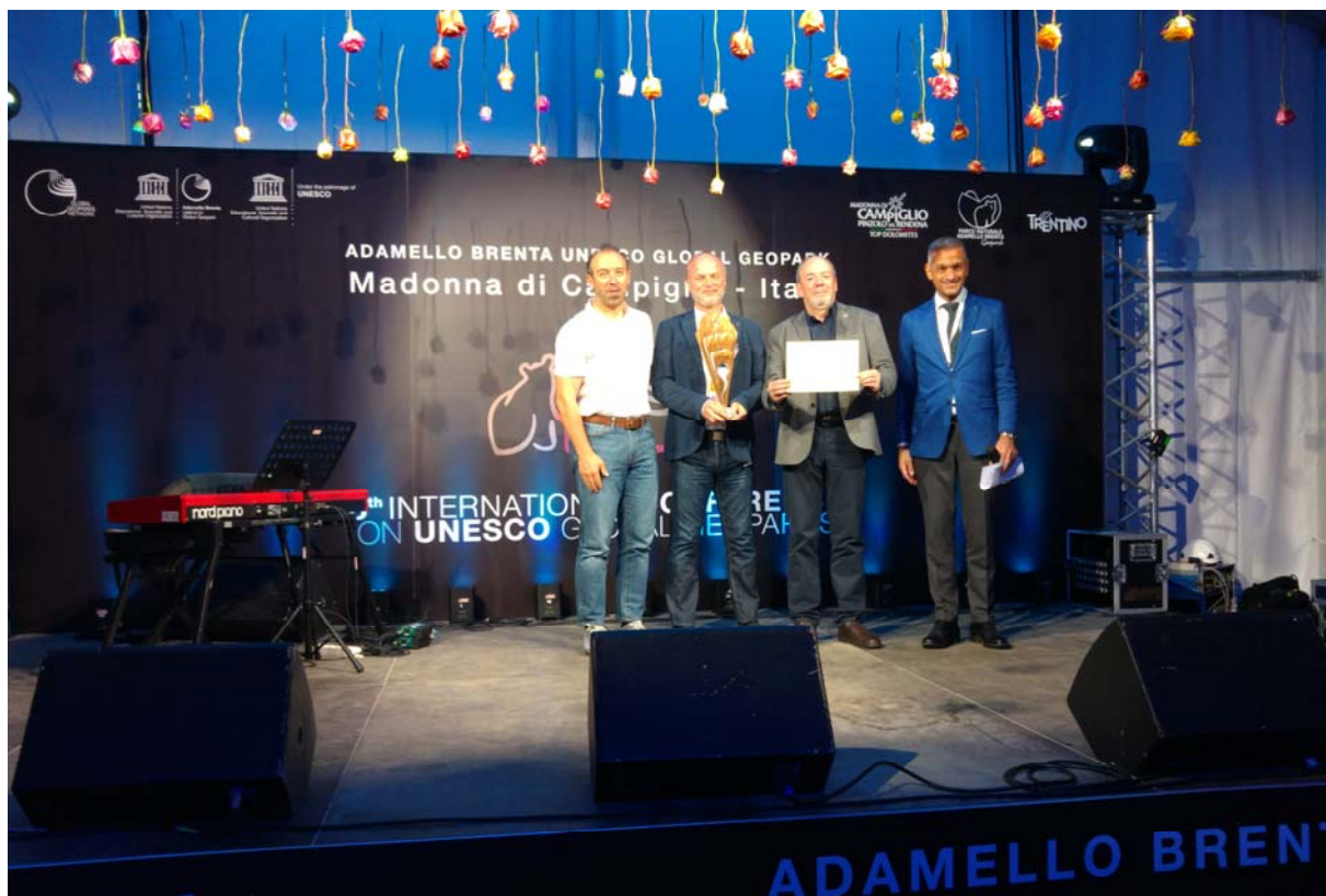
Delivery of the GGN Good Practice Award, Adamello Brenta UGG, September 2018.

Year of inscription / Year of the last revalidation: 2011 / 2017