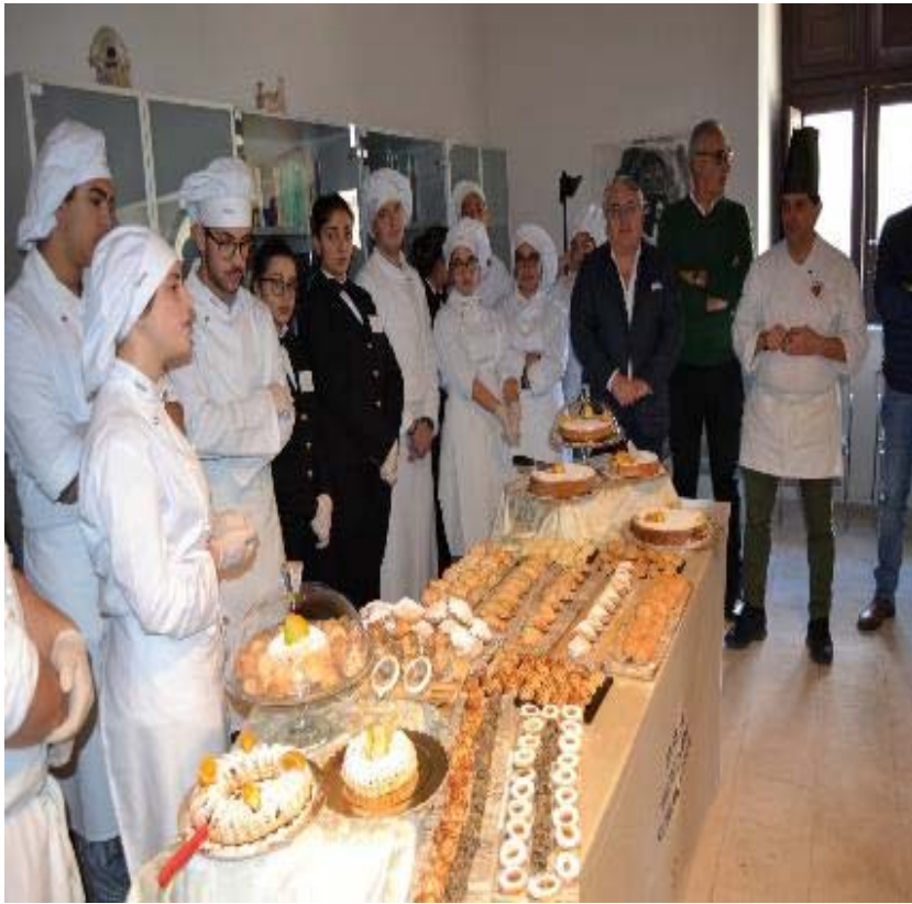
1- author's cinema short film

Year of inscription / Year of the last revalidation: 2001 / 2017