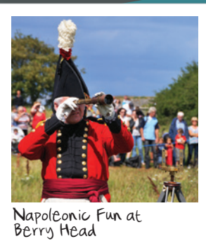
Napoleonic Fun at Berry Head