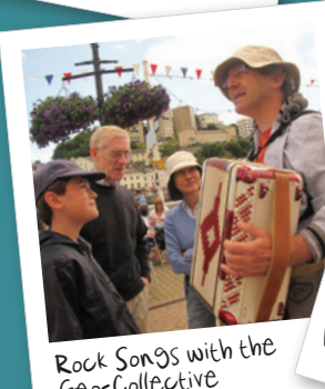
Rock Songs with the Geo-Collective