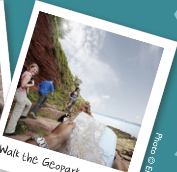
Walk the Geopark coastline