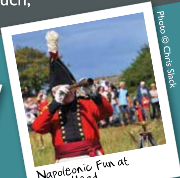
Napoleonic Fun at Berry Head