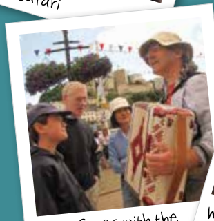
Rock Songs with the Geo-Collective