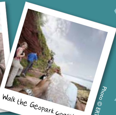
Walk the Geopark coastline