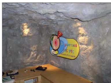
The Discovery center