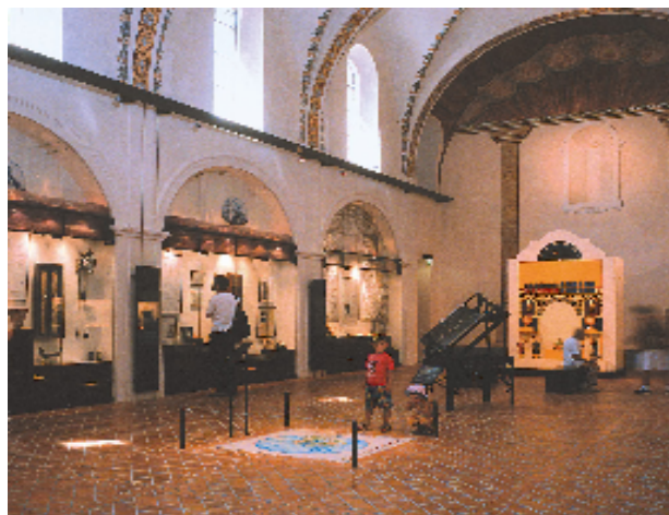
Earth and Time Museum