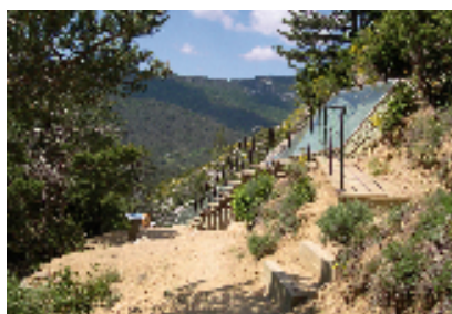
Valley of fossils sirens

Fantastic objects, sculptures of animals, photographs, videos, illustrated panels in an almost maritime freshness plunge you into geological time and Antiquity to resurface in the modern world.