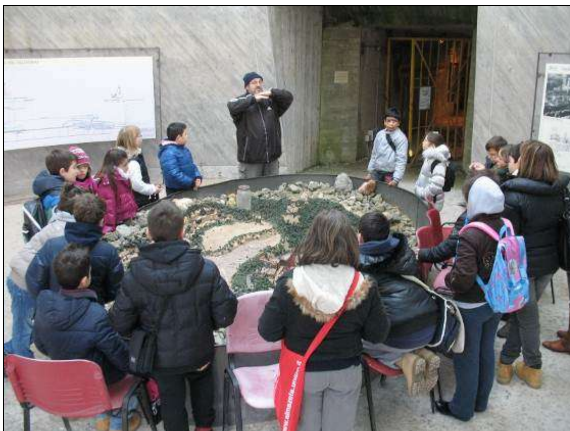
A group of students during “Know the Park” in the Mining Museum of Gavorrano