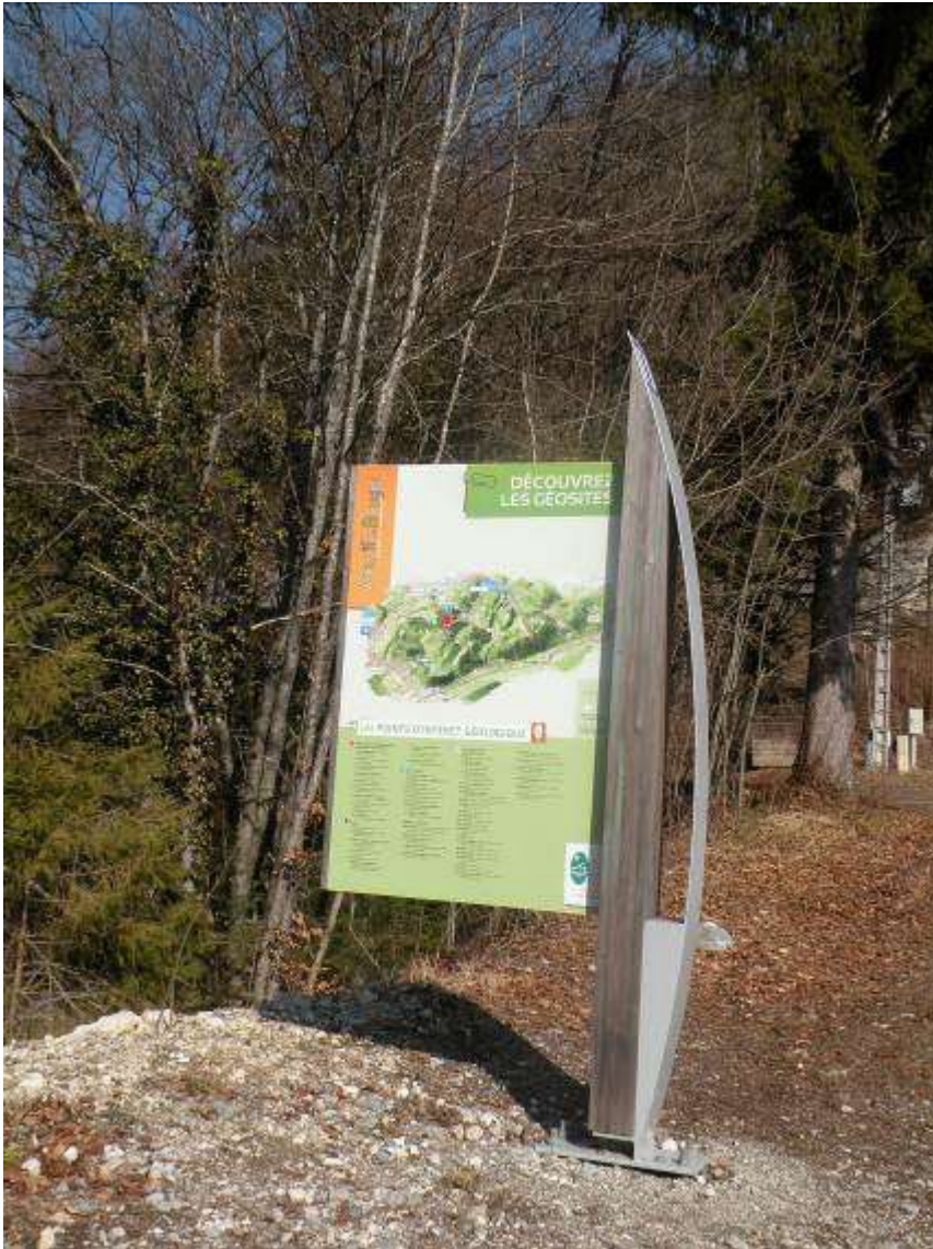
Interpretative panel on geosite.

2011 was an important year for the Massif des Bauges geopark since this is the year of its creation. The activities were numerous and devoted for the first part of the year to the preparation of the expertise and in the second part of the year to the institutional inauguration with the presence of the GGN network.