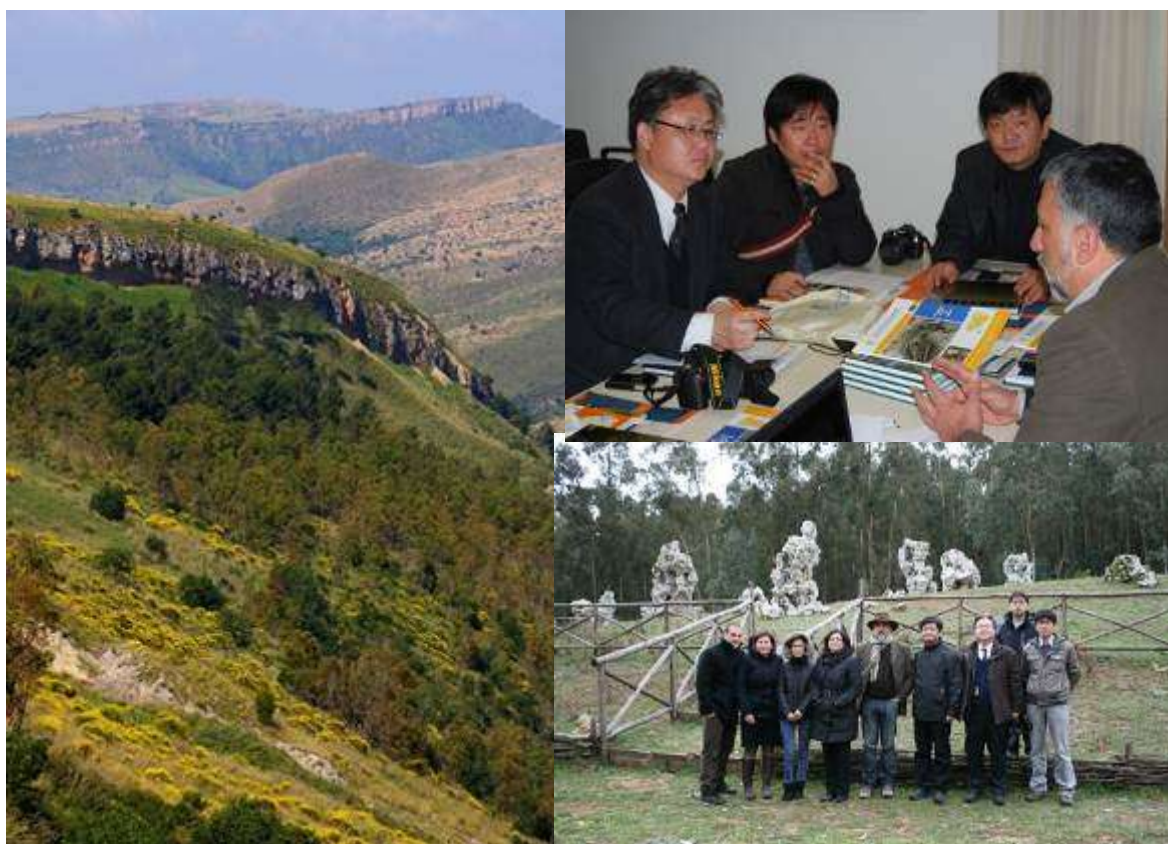
The aspiring geopark of Ganwon DMZ (South Korea) during the meeting in Rocca di Cerere Geopark (February 2011)