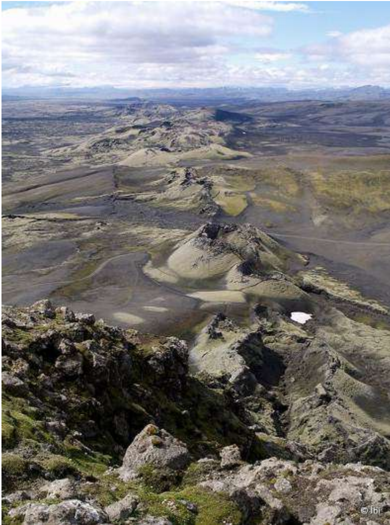
Lakagígar – Craters of Laki (1783)

2011 was the first year of Katla Geopark as a private non-profit organization, having been formally established on November 19 th 2010.