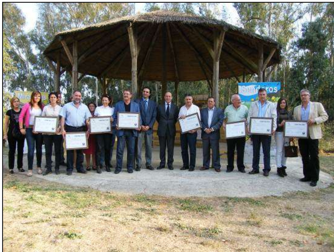
Delivery of diploma accreditation of the European Geoparks Network to municipalities of Sierra Norte de Sevilla Geopark.

In September 2011 the Geopark Sierra Norte de Sevilla was incorporated into the European Geoparks Network, so then started his activities as a European Geopark. But last year the Sierra Norte de Sevilla Geopark has made, prior to joining the Network, various tasks related to the promotion and protection of geological heritage and the promotion of geotourism.