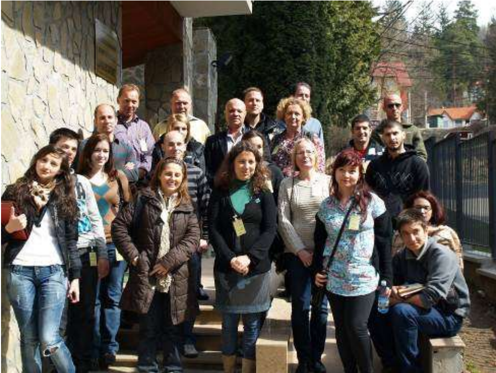
Participants in the Erasmus course on Sustainable development, Geoconservation and Geoparks.