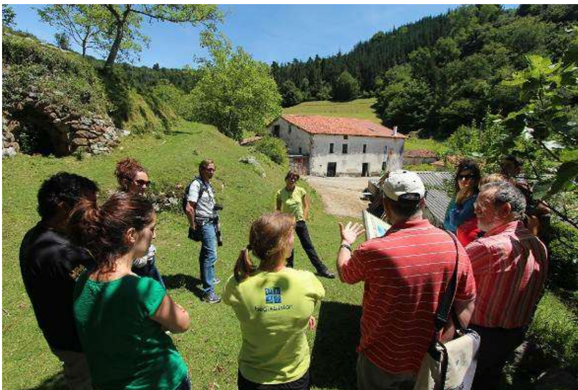
Many new guided tours were organised in the karst area of the geopark in 2011. Above, a guided tour in the Zinoa karst landform, Mutriku. Summer 2011.

At the end of 2011, the Basque Coast Geopark celebrated its first full year of operation. Many promotional activities took place during this time, carried out by the geopark or by its partners. The geopark has also developed many initiatives and carried out intense networking. A few of these activities are listed below: