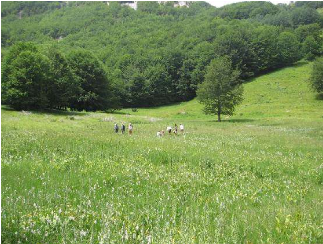
The peat bog area of Fociomboli, near Mt. Corchia