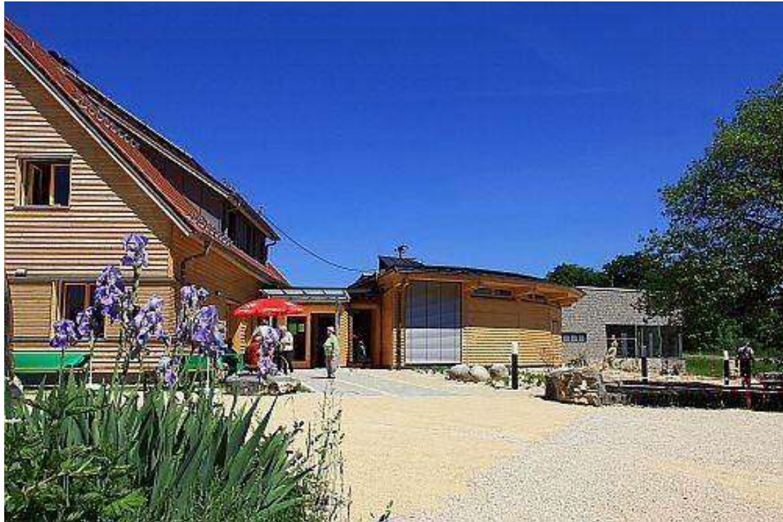
The new Geopark-Infocentre “Naturschutzzentrum Schopflocher Alb” is one of the three new Infocentres which were inaugurated in 2011.

In 2011 the GeoPark Swabian Alb could extend the network of GeoPark Infocentres from 14 to 17. The Infocentres make an important contribution to one of the main task of the Geopark: to give the necessary information on all relevant geological aspects to the visitors everywhere in the Geopark.