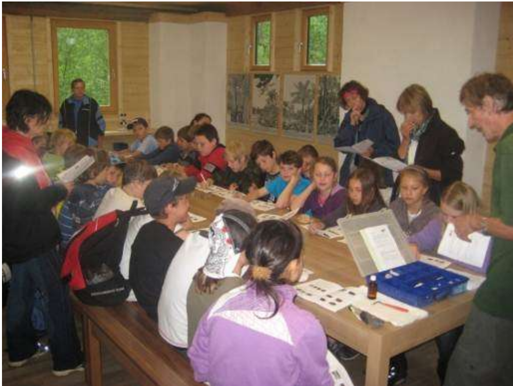
Determining rocks with the park's educational material in the new workroom