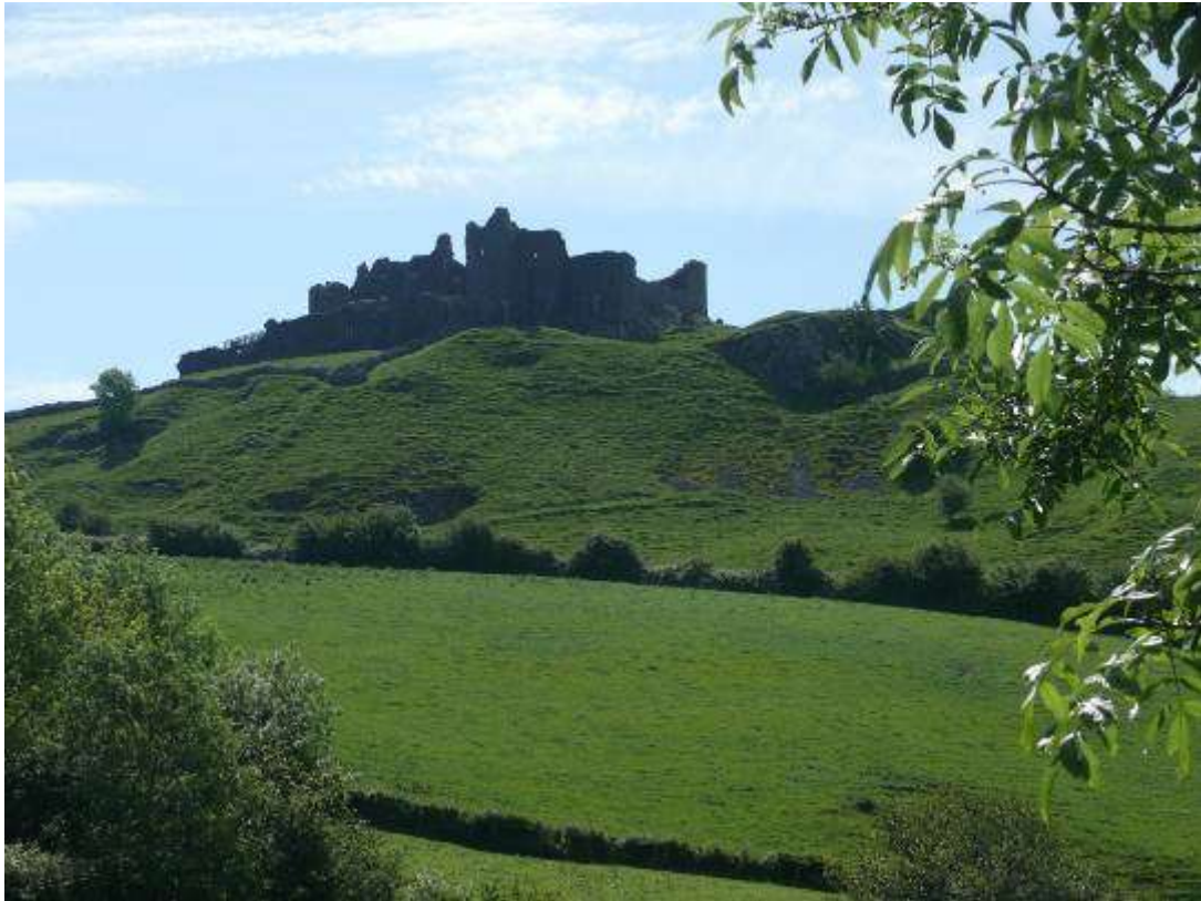
Carreg Cennen Castle is built on a crag of Carboniferous Limestone. This romantically situated site is a popular destination for tourists.

● 27 th EGN Coordination Committee Meeting 28 March -1 April. Fforest Fawr Geopark together with the Brecon Beacons National Park Authority hosted this meeting in the beautiful market town of Brecon. Highlights included the field excursion on 30 March which provided delegates with a tour of the landscape, a visit to a recently restored geosite and an opportunity to meet with and experience the hospitality of the local people. A tour of Carreg Cennen Castle followed by a dinner showed how a local businessman makes use of this spectacular location to create sustainable employment.