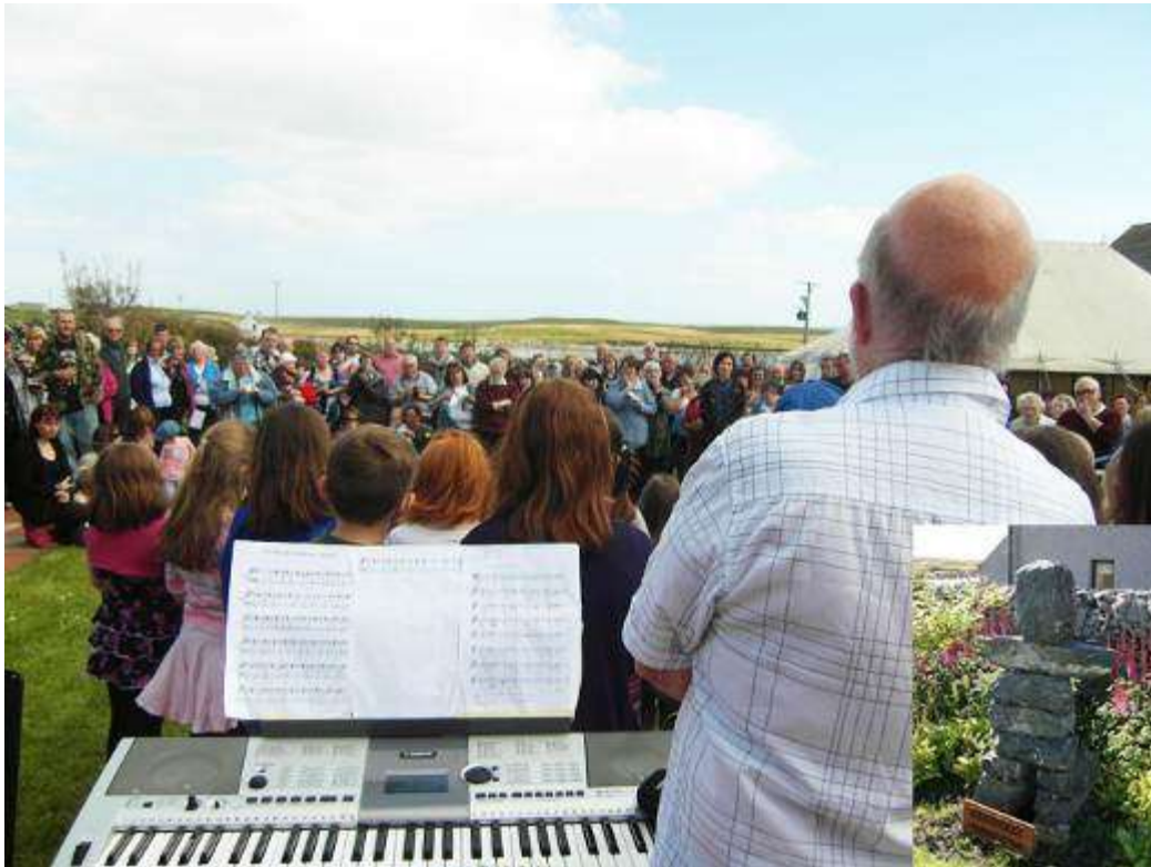
Launch of geological exhibits and booklet at the Old Haa, Burravoe, Yell with (inset) Inuksuk of Lewisian Gneiss.

With a geology spanning almost 3 billion years, Shetland is more geologically diverse than any similar sized area in Europe. Geopark Shetland is bringing to life the fascinating stories behind Shetland's rocks, and how they have influenced every aspect of life in the isles.