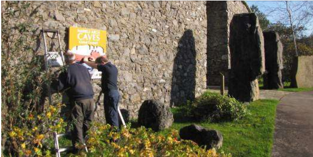
New tourism signs and interpretation panels being erected in the geopark