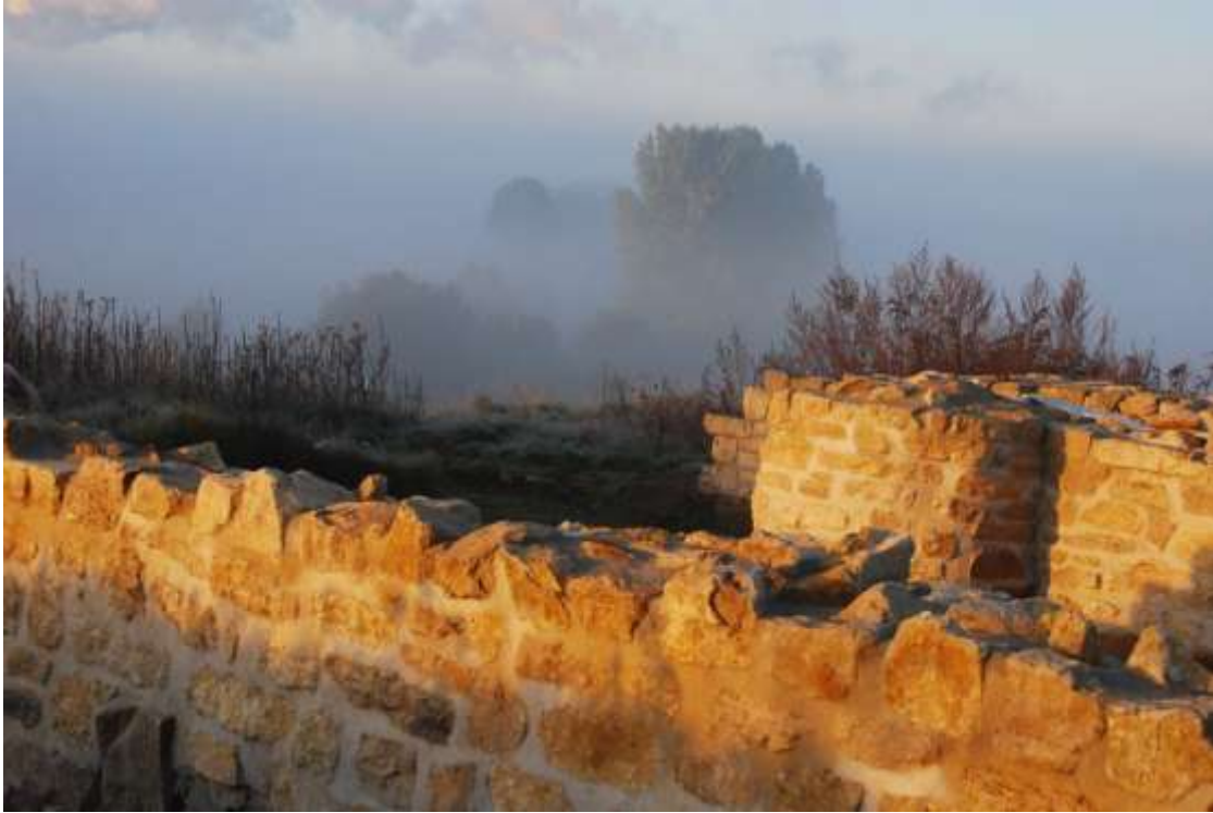
Archeological and Landscape Park Imperial Palace Werla