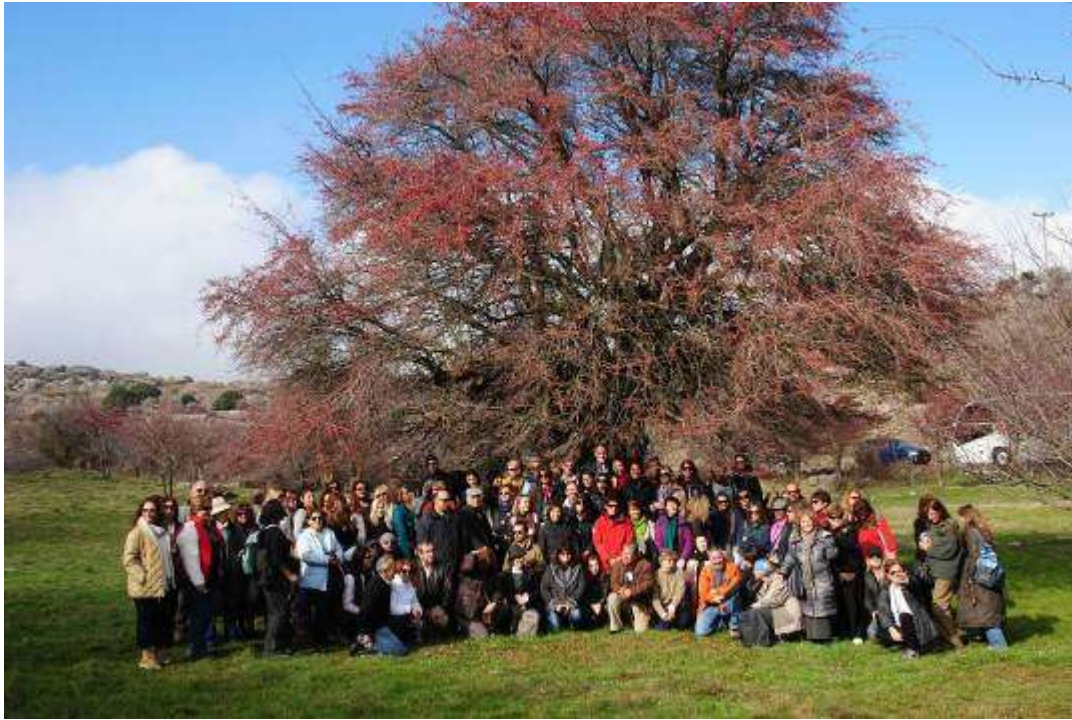
Participants of National Tourist Guides Meeting in front of the monumental Crataegus monogyna at the Archaeological site of Zominthos.

2011 was a very difficult period not only for Psiloritis Geopark but Greece in general. The economic crisis affected many sectors of public and private activity resulting in a significant cut down of Geoparks budget. Local authority's contribution was minimized as well as other initiatives like LEADER+ or other national projects expected more than a year, present significant delay. Hence many of the planned activities of geopark have been postponed awaiting the initiation of these projects.