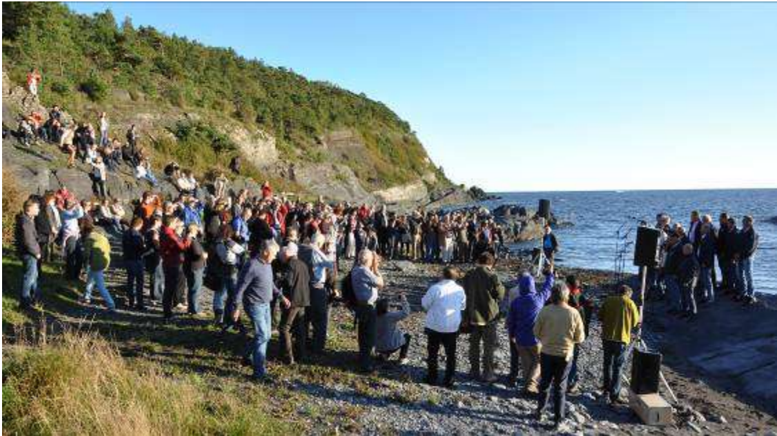
Steinvika Geopark site

The first European Geopark in Norway is situated in south-eastern Norway, in an area boasting outstanding geological features. The Geopark tells the story of 1 500 million years of geology, a fascinating journey through time. The Geopark area encompasses seven cities, but also beautiful landscapes including a skerry coast, fjords, agricultural land, forests and mountainous areas.