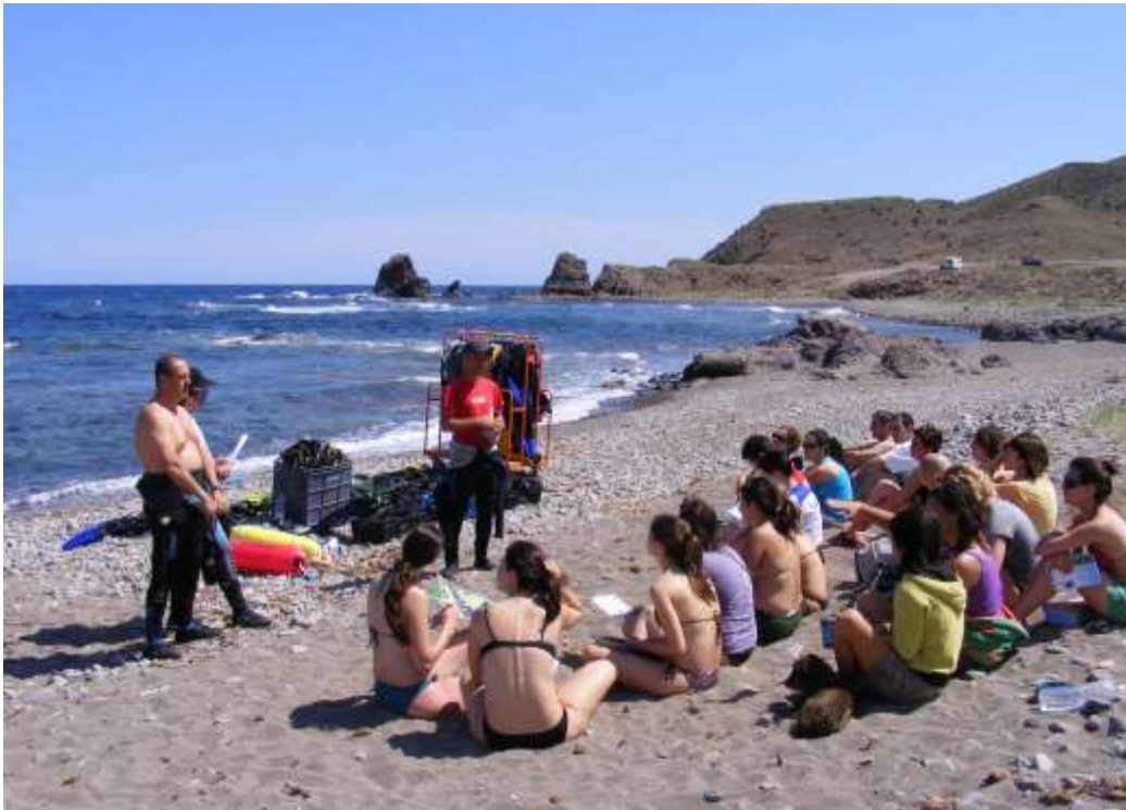
2011 EGN week. Snorkeling with Geoparks collaborators enterprises

2011 has been a year full of challenges and as Geopark we face them strengthening our relationship between enterprises and local population.