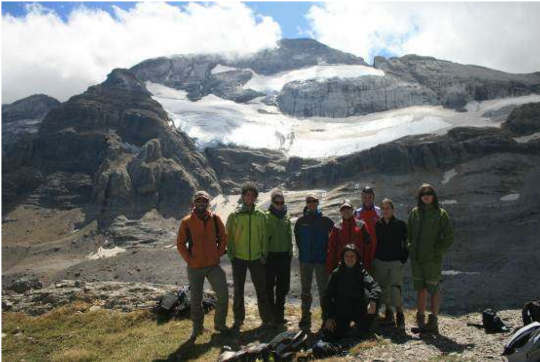
2nd Intensive course on Geological Heritage. Glacier of Monte Perdido

Year 2011 has been especially important for the Geopark area regarding paleontological and educational activities