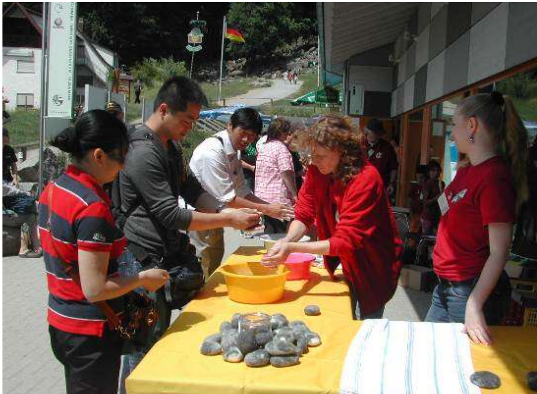
Activity day during the EGN week with guests from the partner Geopark Mt. Lushan (PR China)

The diverse landscape of the Geo-Nature Park is characterised by over 500 million years of eventful geological history, a multi-faceted natural landscape, and a thousand year old culture. The Geopark Rangers offer a wide range of activities catering for visitors who enjoy delving into the past, the silence of the forests and hills or discovering the landscape and the regional delicacies.