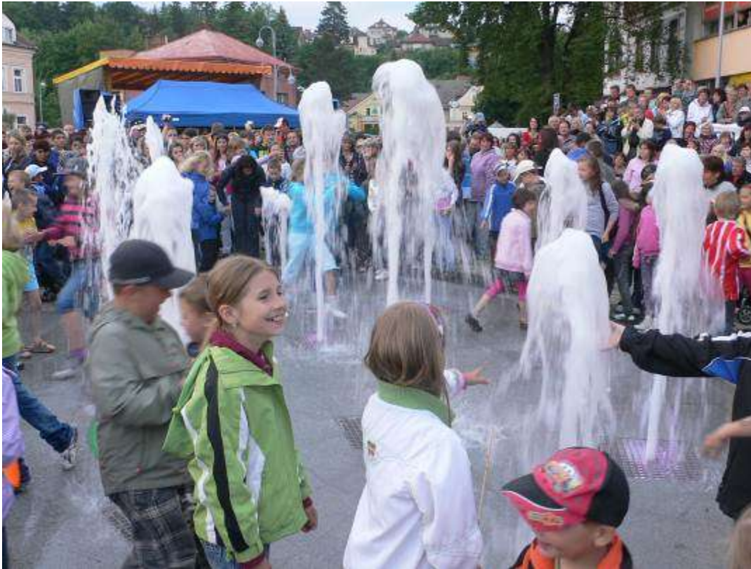
Opening ceremony of a new outdoor Bohemian Paradise Geopark exhibition in Semily (June, the 1 st 2011)