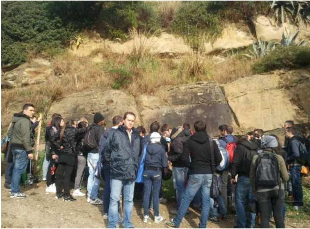
Guided visit with University of Salerno

During 2011 the National Park of Cilento and Vallo di Diano (European and UNESCO Global Geopark) continued its work to improve the geological heritage conservation activities within the frame of the wider and more complex strategy of conservation of the natural and cultural-historical heritage of the protected area.