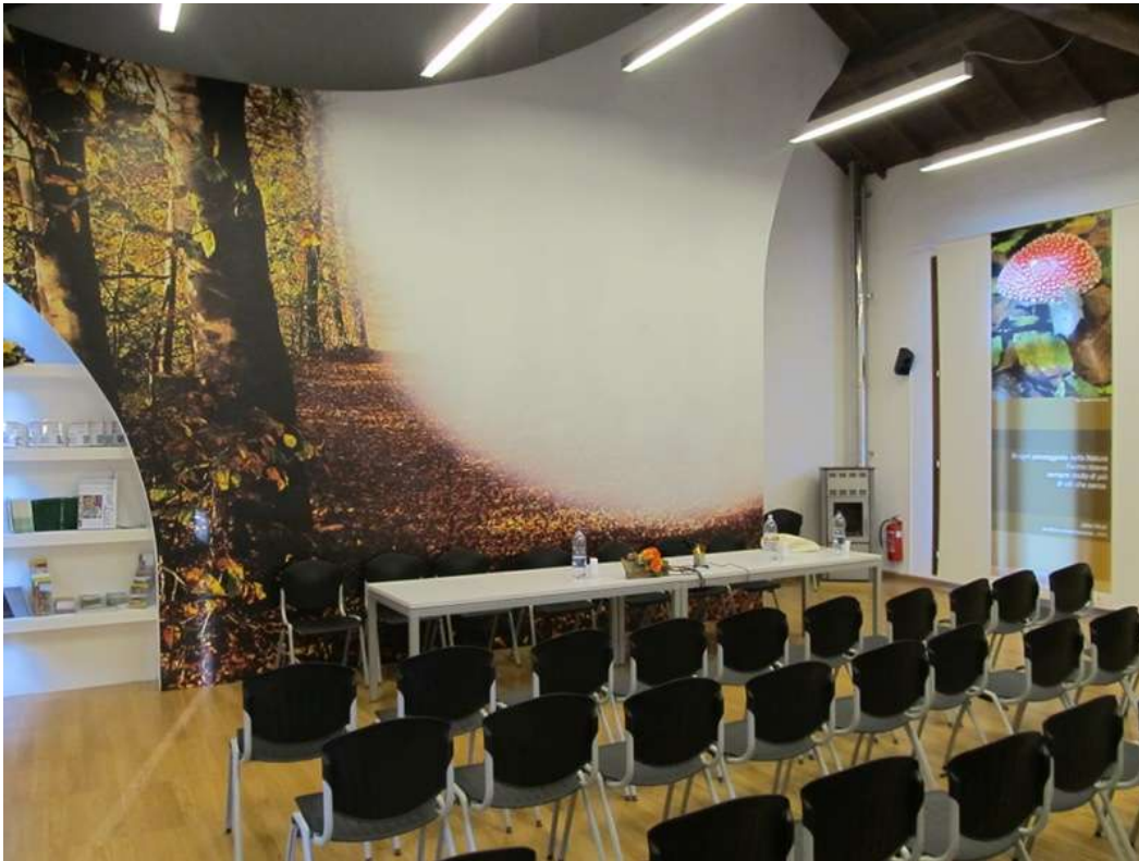
The new Geopark information and interpretation facility in Sassello

During 2011 the Beigua Regional Nature Park (European and Global Geopark) continued his work to improve the geological heritage conservation activities within the frame of the wider and more complex strategy of conservation of the natural and cultural-historical heritage the protected area has. New projects and opportunities were developed.