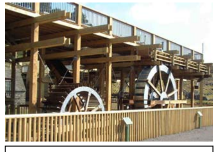
Interactive waterwheels to experience 'The Power of Water'

The Nenthead Mines visitor centre, shop and café.