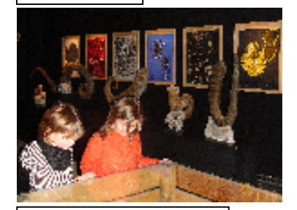
Ammonite and art